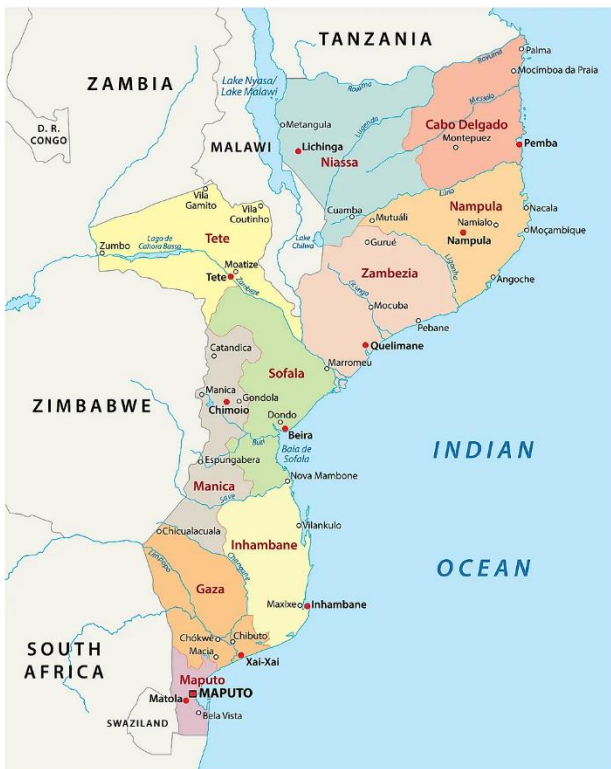
Figure 1 Regional map of Mozambique.

In the Zambézia Province of Mozambique, where gender and socio-economic inequalities persist, NAFEZA (Núcleo das Associações Femininas da Zambézia) emerged as a strategic response. As a women-led coalition, NAFEZA brings together grassroots organisations united by a shared mission to uplift women and girls through education, advocacy, and sustainable development.